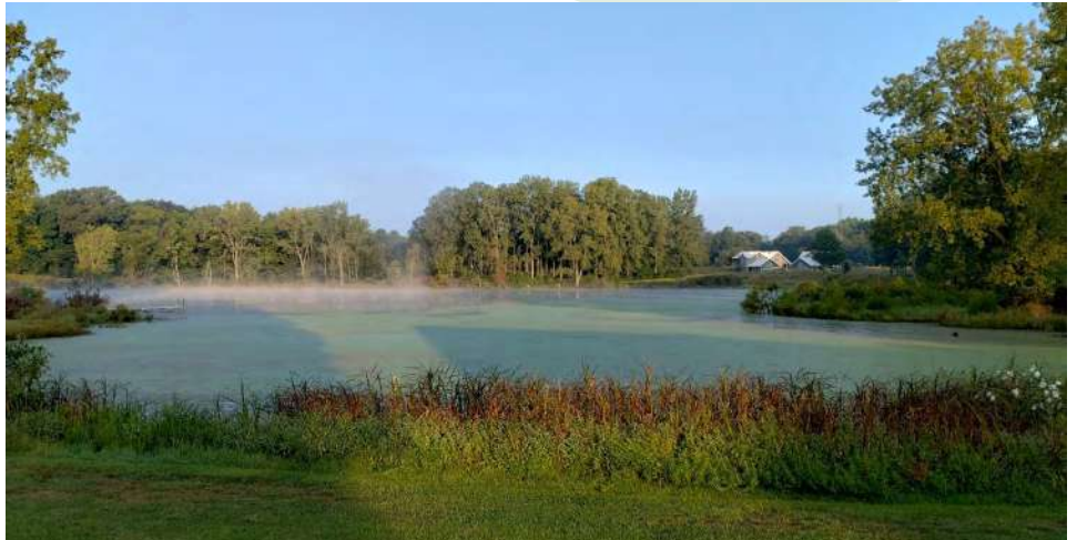
Early morning "lake fog" on Kesling Wetland.

Check out some of our most noteworthy moments and milestones below - we can't wait to see where the rest of the year leads us!