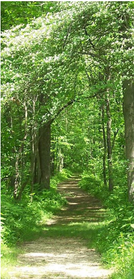
Hiker Sherri Patterson captured this photo of an inviting trail.

The hiking trails at Merry Lea stretch over eight miles and are open to the public everyday from sunrise to sunset. Most of the trails are concentrated on the east side of the property, around and between the Learning Center Building, Farmstead Site, and Rieth Village. They wind through thick forests, around lakes and wetlands, and through prairies, shrub carr and meadows. Since the whole of Merry Lea property is considered a classroom for learners all along the age spectrum, the trails are designed to give access to the various ecosystems and wildlife that inhabit this 1,189-acre natural sanctuary.