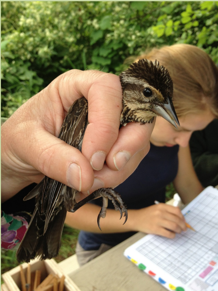
Lydia Yoder, a 2013 Goshen College graduate, pores over the columns of statistics that must be hand-logged for the MAPS program while a female red winged blackbird awaits its freedom.

A bright spot from MAPS research overall is the increase in wetland birds during the past 30 years. This is likely due to changes in laws. Current legislation encourages wetland protection and restoration efforts in ways it didn’t in the past. Meanwhile, the species of most concern are ground-nesting birds that favor forest interiors. These include wood thrushes, cerulean warblers and ovenbirds. Ω