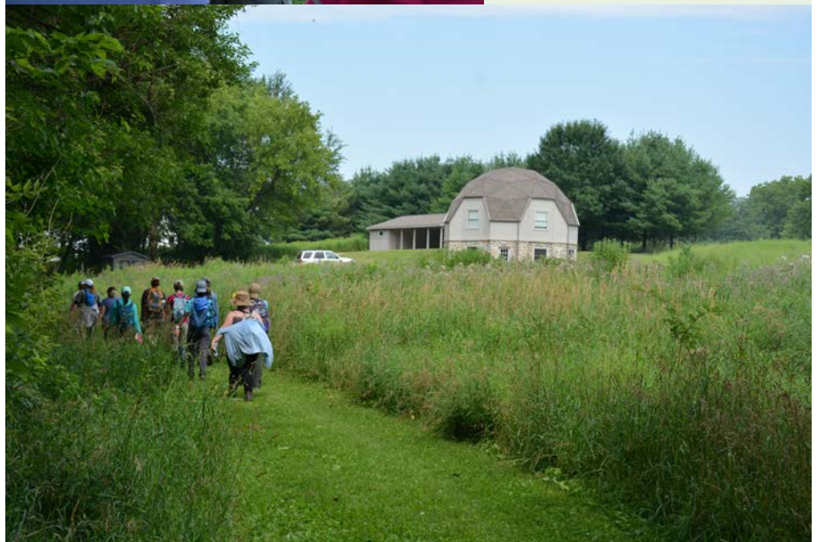
The eleven members of the 2019 - 2020 master's cohort arrive at the western edge of Merry Lea's property after a four-hour hike. The dome in the background is part of the Glacial Retreat Center and is used for geology programs.