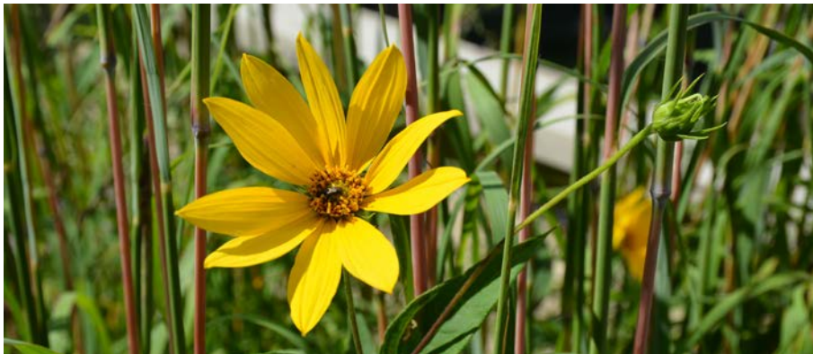
A woodland sunflower in bloom at the Learning Center Building.

I encourage everyone to pause each day to enjoy the warmth of August and the seasonal changes that September brings. Peace. ☪