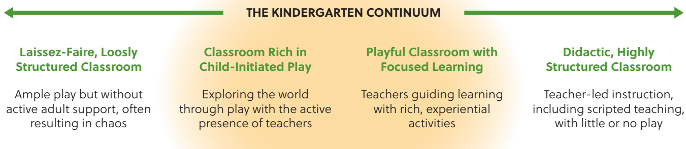
Figure 1. A conceptual model for Kindergarten curriculum | Source: Crisis in the Kindergarten, Miller and Almon (2009)